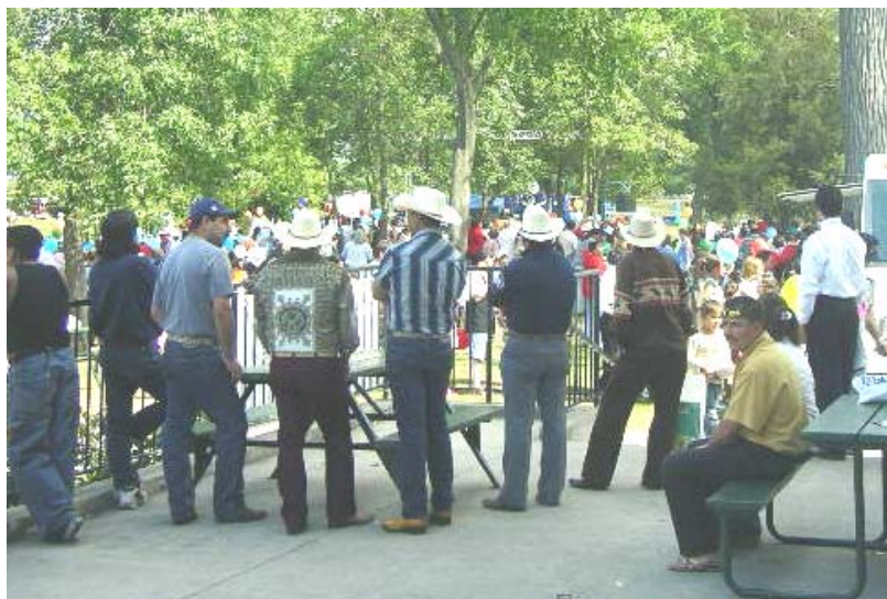
Figure 5.1: Enjoying the music from a distance at the Information Fair, 2004

Press Gazette, 2004). These types of events bring the Latino population into the community and can provide a formal introduction between the local and immigrant populations.