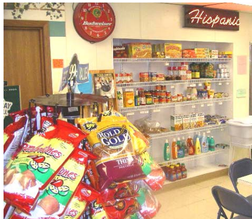
Figure 5.2: The selection of Latino food at local convenience store

One of the more tangible or visible signs of the immigrant community is the increasing variety of Latino stores in the urban centers of Green Bay and Manitowoc. Even local convenience stores are getting in on the action, offering a limited selection of Latino foods for their local immigrant populations. The photo below (Figure 5.2) was taken in a gas station in a neighboring village near Luxemburg. The ability for immigrants to get the foods and products they are accustomed to helps them to recreate their lifestyles from Mexico and Central America. In fact, 96% of the immigrant interviewees agreed that there are enough restaurants and stores where they can buy products from their country of origin. Green Bay has the largest concentration of Latinos within the research area. Here one can find businesses geared toward the Latino immigrant such as butchers, car dealerships, clothing stores, legal services, and bars. Having these services available in Spanish, by people they are comfortable interacting with is contributing greatly to the cohesiveness of the Latino community.