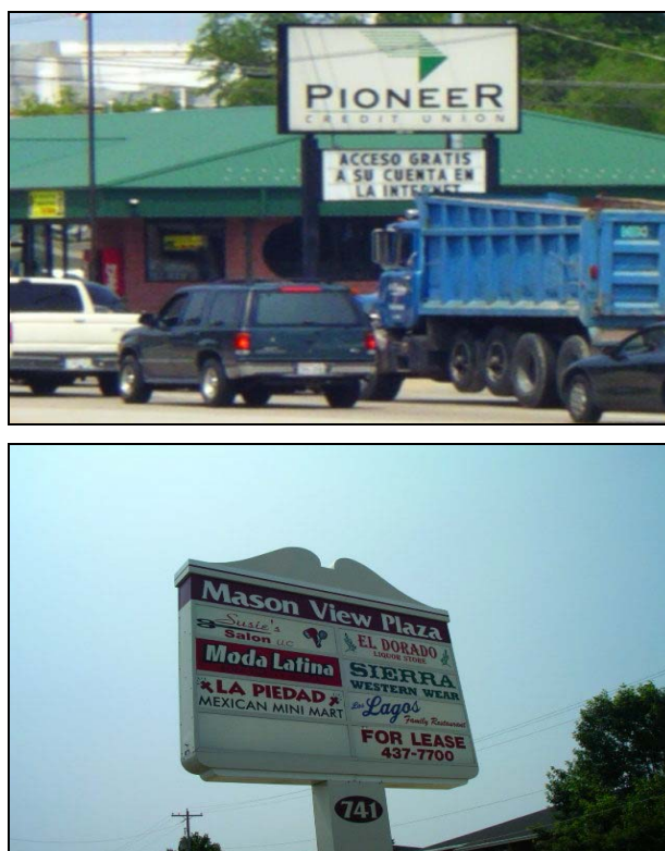
Figure 3.1: Examples of the increasingly visible Latino immigrant community in Green Bay, WI.